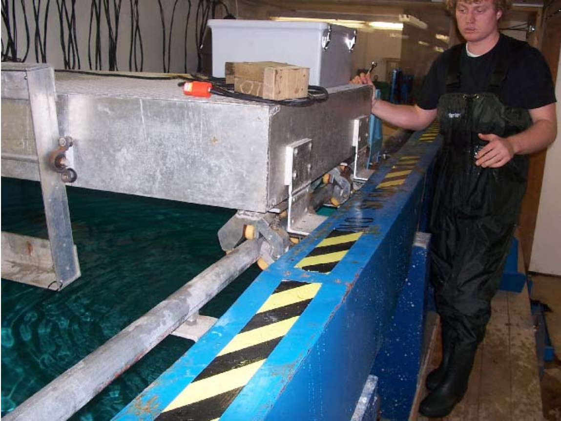
Figure 2. Tow Tank Test Run

The carriage speed can be collected through the use of a rotary encoder mounted motor. A report of the encoder selection and mounting bracket design was generated: ( Encoder Selection & Mount Link )