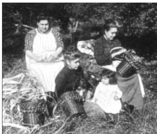
Basketmakers on Indian Island, circa 1900