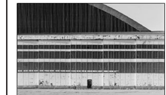
Aircraft Hanger. Limestone, 2005