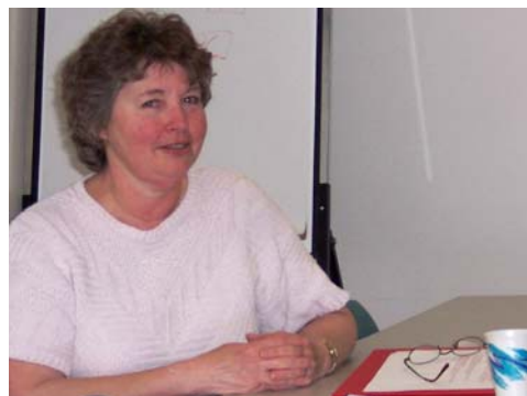
A new RSVP volunteer attends the latest Community Educator workshop, a training in Emergency Preparedness.

Training for new volunteers is scheduled monthly and in various locations for volunteers convenience. Training includes