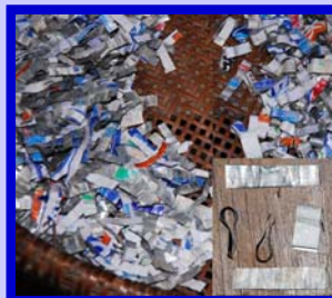
Figure 2: Aluminum strips.

He, F. and B. He. 2002. Distribution and habitat for cultivated Camellia oleifera . Scientia Silvae Sinicae 38(5):64-72.