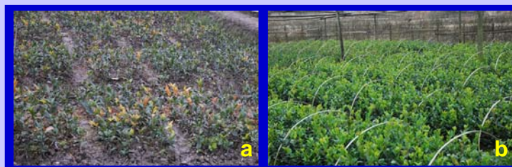
Figure 4: Field planting of hypocotyl grafted Camellia oleifera plants. a. newly planted grafted plants with a randomized complete block design and b. growth of grafted plants in their 2 nd year.