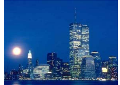
New York City Line

Like I said before this is still mostly tentative since we haven't been able to confirm with all of these stops yet. If you would like to see a concert in your area you can check out our website at: www.umaine.edu/singers .