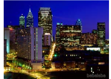
Philadelphia Sky Line

As I mentioned earlier, this is schedule is tentative and liable to change quite a bit. If you are interested in having University Singers perform at your school, or would like to know our most up-to-the-minute tour information, please check out our website at www.umaine.edu/singers .